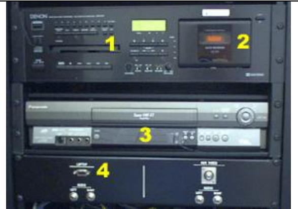
(1 - CD player, 2 - Cassette Player, 3 - VCR, 4 - Laptop Connection Port)